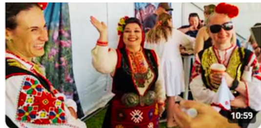
Bulgarian Rhythms at Zdravei Festival Adelaide | A Celebration of Bulgarian Culture in Australia

The first weekend of March, the students at the Bulgarian Language School "Petar Beron" will have a special craft session where they will handcraft Martenitsi, a traditional Bulgarian symbol of health and prosperity. It's a wonderful opportunity for the children to learn more about Bulgarian customs while engaging in a creative activity. Families are reminded to ensure they've registered their children's intention to attend the school this year through the Rodina website. We look forward to seeing everyone there!